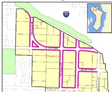
Figure 2— Area of Required Retail, Restaurant or Personal Services Use Along Ground Floor Street Frontages

"Setbacks. a. 78th Avenue SE. All structures shall be set back so that space is provided for at least 15 feet of sidewalk between the structure and the face of the street curb, excluding locations where the curbline is interrupted by parking pockets. Additional setbacks are encouraged to provide space for more pedestrian-oriented activities and to accommodate street trees and parking pockets"